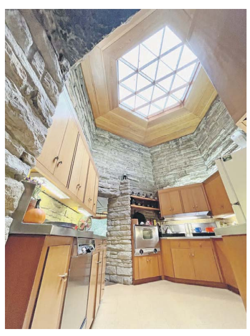
The kitchen at Kentucky Knob in Dunbar, Penn. The 2,200-square-foot house was designed by Wright in a hexagonal grid design.