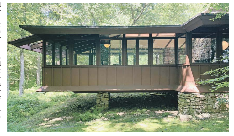
The 125-acre Polymath Park in Acme, Penn., contains two FLW houses, with a third awaiting reconstruction.