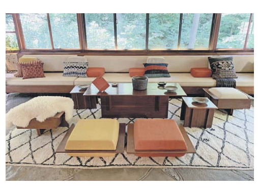
Wright's Fallingwater in Mill Run, Penn., is bold, brash, risk-taking, innovative and striking.