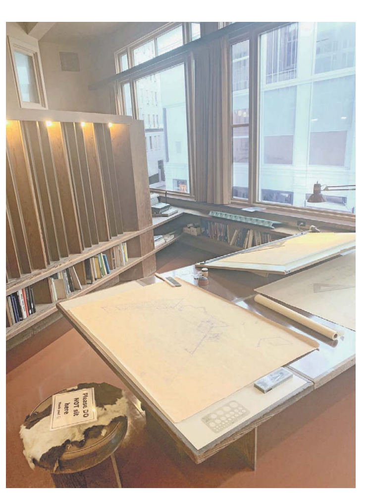
Drafting boards from Frank Lloyd Wright's office in San Francisco are now on display at the Hagen History Center in Erie, Penn.