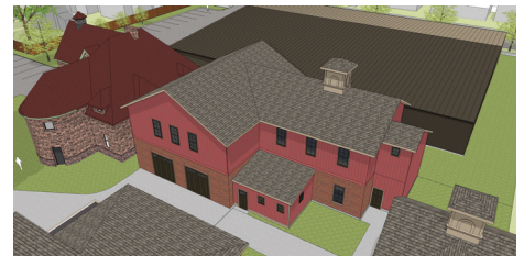
New exhibit building planned on the campus of the Hagen History Center.