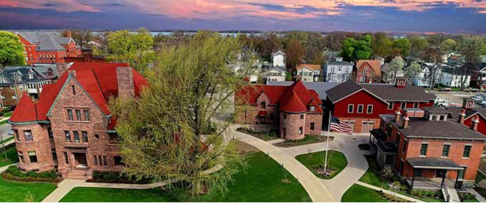
Hagen History Center will reopen this summer with four exhibit buildings with 11 new exhibits.

Welcome to the new Hagen History Center. With all of our changes, we will truly be one of America's Newest Museums. Our promise to you is to bring inspiring history to our visitors and our community. Inside you can read about our new Mission and Vision Statements and see our new goals for the present and into the future.