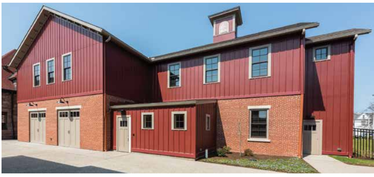
The new exhibit building will open this summer with numerous exhibits.

Guests will see 11 professionally curated exhibits inside the Watson-Curtze Mansion, the Wood-Morrison House and the new exhibit building. More than 11,000 square feet will welcome tourists and guests. Highlights include: Watson-Curtze Mansion's new exhibit