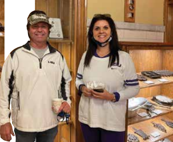
Left: This is a small section of the Griswold collection inside the Watson-Curtze Mansion kitchen. More than 100 pieces are on display.

The Mansion displays hundreds of Griswold pieces in the kitchen (with a total collection of more than 700 items). The collectors spent three days in Erie for their national meeting.