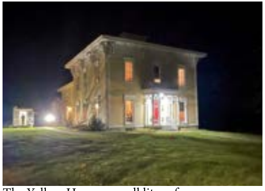
The Yellow House was all lit up for popup dinners in November.