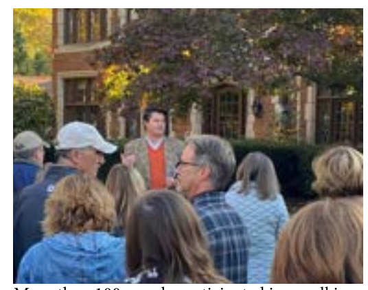
More than 100 people participated in a walking tour of Glenwood Hills with stops to hear the history of 8 different homes.