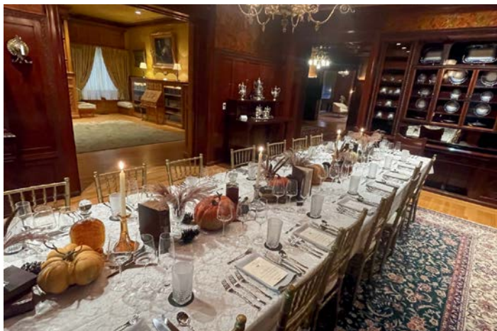
The Watson-Curtze Mansion Staff Photo

We've hosted more than 20 weddings/celebrations this year, and we have 23 more already in the books for 2025, plus a few more in 2026!