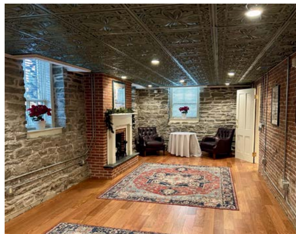
The President's Room Staff photo