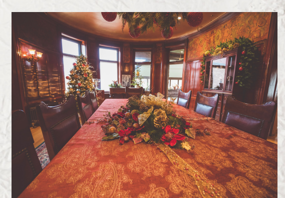
The mansion is decorated for the holidays with a tree in nearly every room.

Geri Cicchetti and Cal Pifer were away from the office on picture day, but we captured them in their finest flannel and houndstooth.