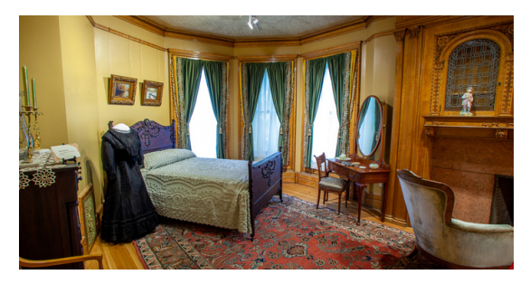
The Curtze Legacy Room is in the Watson-Curtze Mansion.

Non-Profit Org. U.S. Postage PAID Erie, PA Permit No. 433