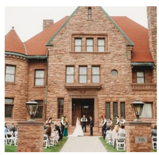
We have the perfect place to say, "I do."