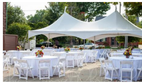
More than 500 guests have attended events at the Mansion with outdoor seating and tents.