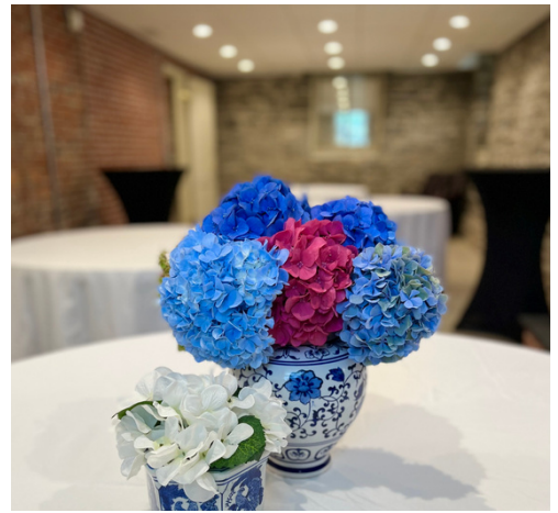
The President's Room is our newest venue.