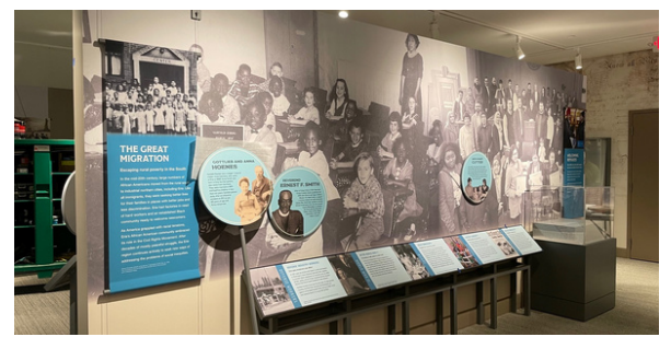
The Story of Us exhibit has been popular among Erie residents past and present.