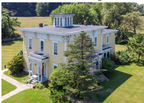
More than 120 acres surrounds the Battles Yellow House in Girard.