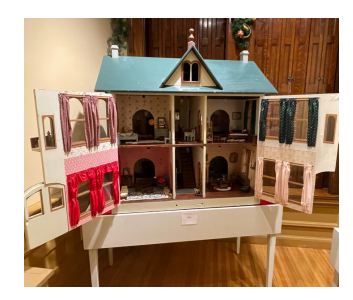
This 1890s dollhouse is among the dollhouses on exhibit on the second floor of the Watson-Curtze Mansion.