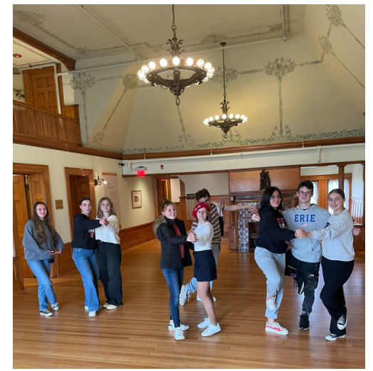
French exchange students from Fairview High School enjoyed a free tour of the campus and danced in the mansion ballroom.